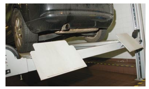
Figure 4 Hinged end-stops help prevent the vehicle falling from the lift when elevated

Vehicle lifts need to be thoroughly examined periodically by a competent person, who should issue a 'Report of Thorough Examination'. It is recommended that this is done every six months. Although this should identify problems, it is not a replacement for regular in-house checks and maintenance – in the same way that you shouldn't rely on an MOT to keep your vehicle roadworthy.