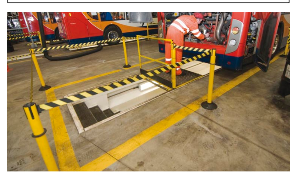
Figure 8 Extendible barriers warn workers about the open pit area

A self-employed garage owner was found dead in a vehicle inspection pit. There was a car over the pit with the engine running. It is believed he was repairing the exhaust pipe when he was overcome with carbon monoxide fumes.