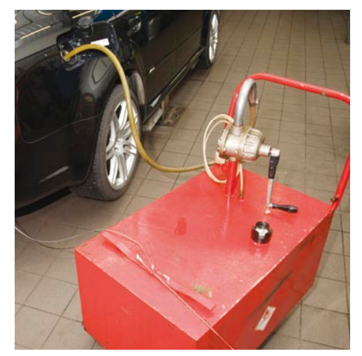
Figure 9 Fuel retriever – note metal collection tank and earthing straps