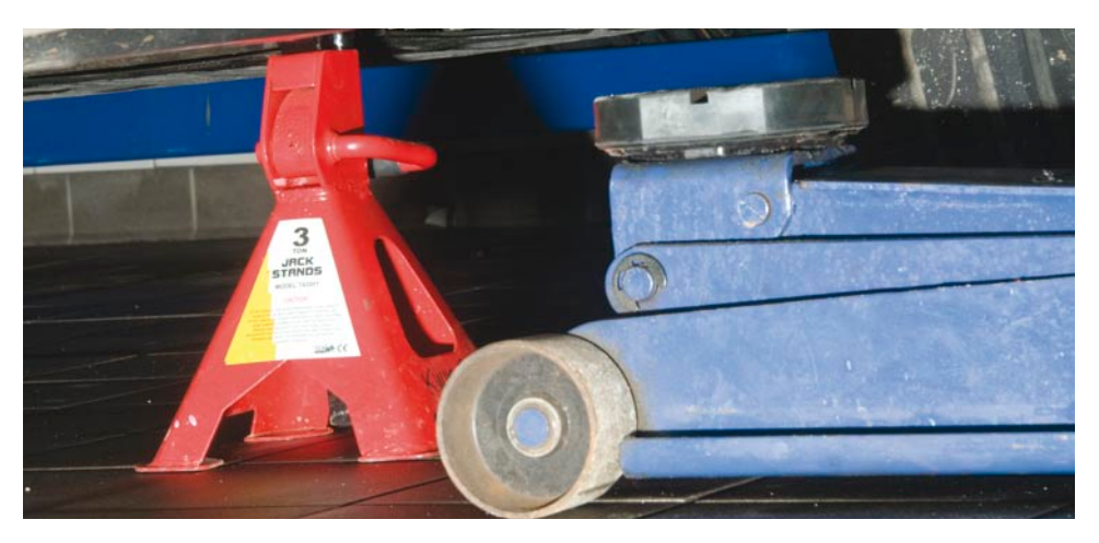
Figure 1 Car with trolley jack and axle stand on a firm, level surface