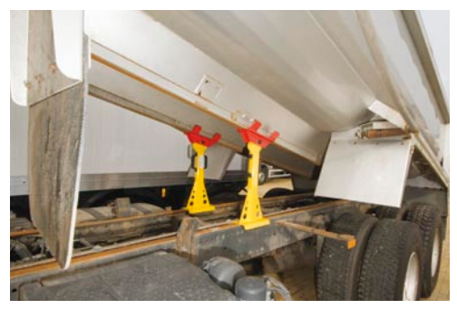
Figure 6 Props for a tipper lorry

A worker was recovering a broken-down bus from the roadside. While underneath the vehicle and winding the back brakes off, the suspension airbag on the bus blew and the bus came down and crushed him to death.