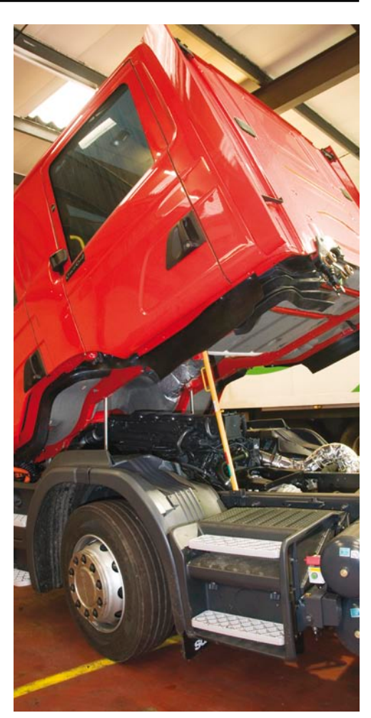
Figure 5 Prop for an HGV cab

A coach pulled into a garage with air suspension problems (later found to be an intermittent wiring fault). An experienced mechanic went underneath without propping the vehicle. While he was there, air was released (probably by the mechanic working on the suspension unit) and the coach dropped, crushing him. He suffocated to death.